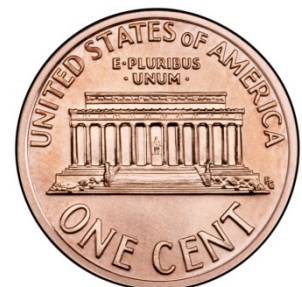
Reverse (back) of the Lincoln Memorial penny