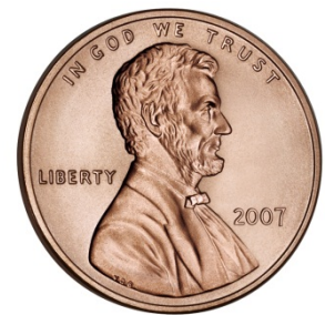
Obverse (front) of the Lincoln Memorial penny

You were asked to decide between these two possibilities in question 10 above, in light of the probability you calculated in question 9. Statisticians have a rule of thumb for making this kind of decision: when the probability for some event to occur by chance is less than 5%, we tend to discard the original belief (that the coin was fair) and choose to believe the new belief (that the coin is not fair). An event that is unlikely to happen by chance is called statistically significant . That is, although lots of tails from a fair coin can occur by chance sometimes , we don't believe that it occurred by chance this one time because the probability is so small. Now look at the number of spins for your penny and repeat the calculation in questions 8 and 9 for your penny. Use the histogram to find a probability that a fair coin lands tails up (just by chance) as many or more times as your penny did. Do you have enough evidence to reject the belief that your penny is fair?